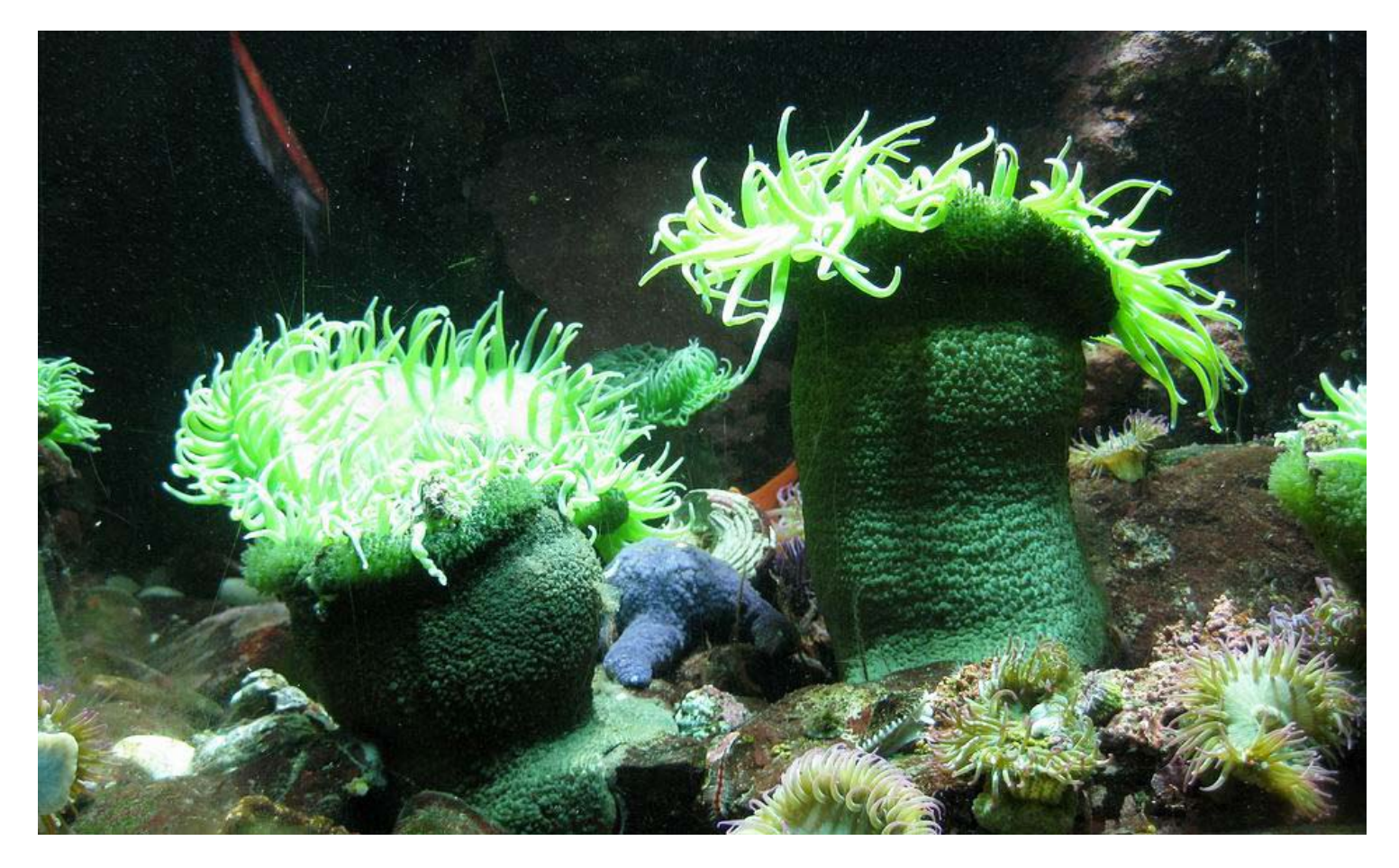
Anemones of a different sort at the magnificent Aquarium