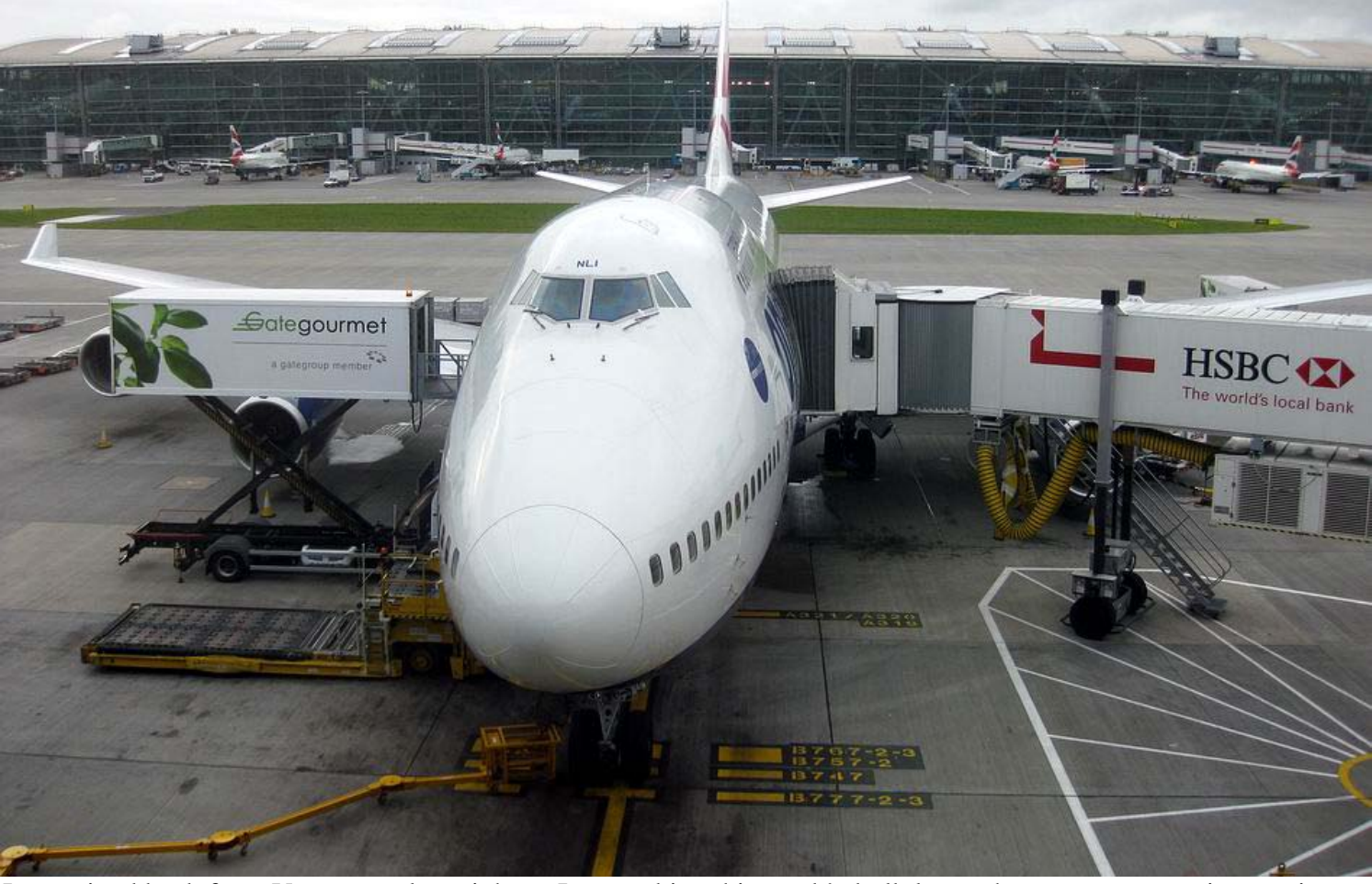
Just arrived back from Vancouver last night so I am making this week's bulb log a photo essay on my impressions.