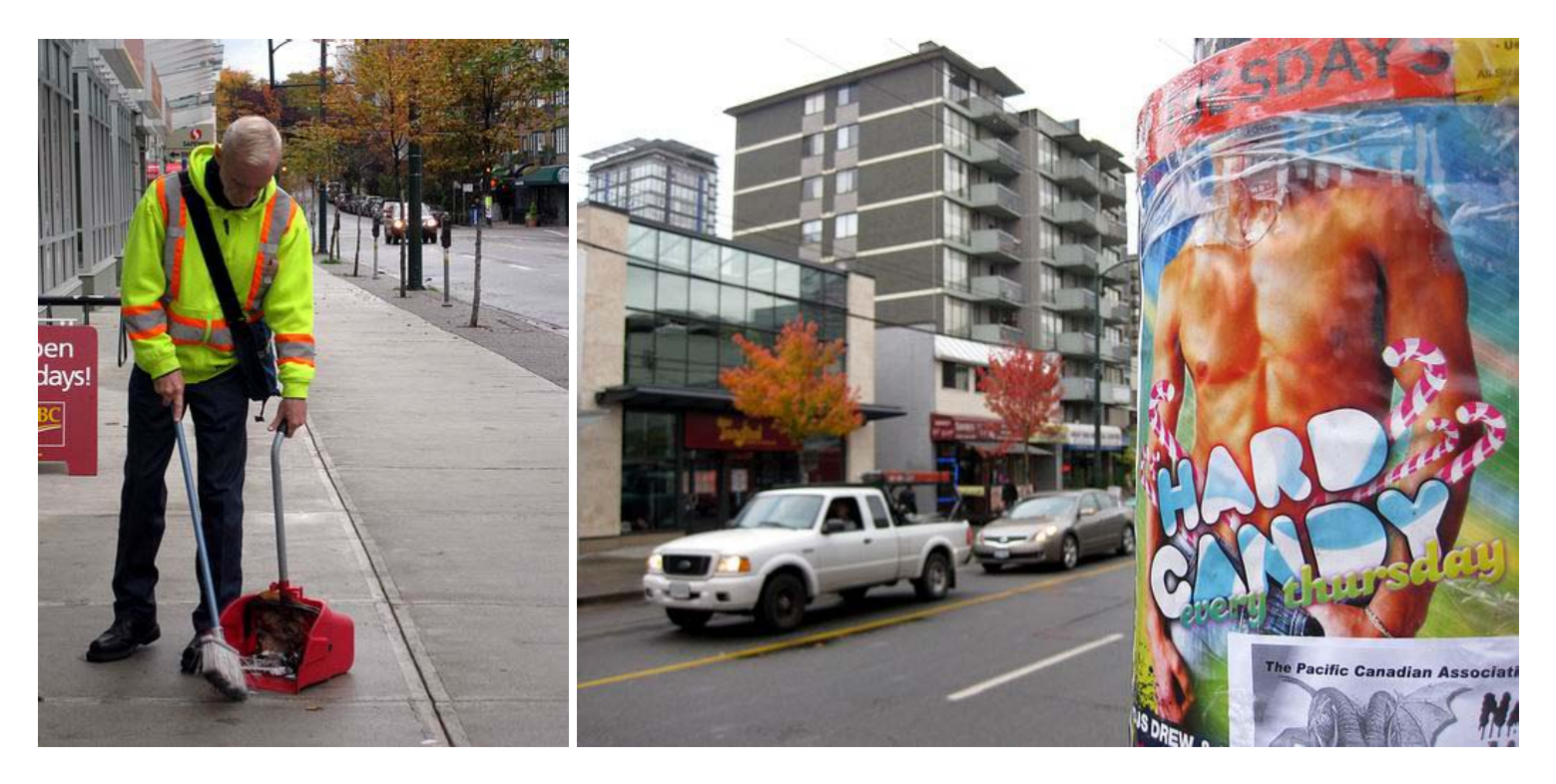
It is a wonderful city full of colour and plants every where you look.